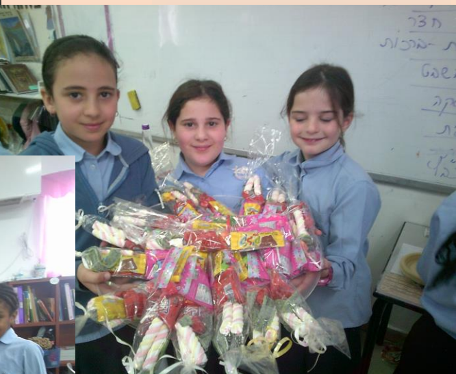
Tu B'Shvat Extravaganza in Kita Gimme! Every Bracha accounted for!